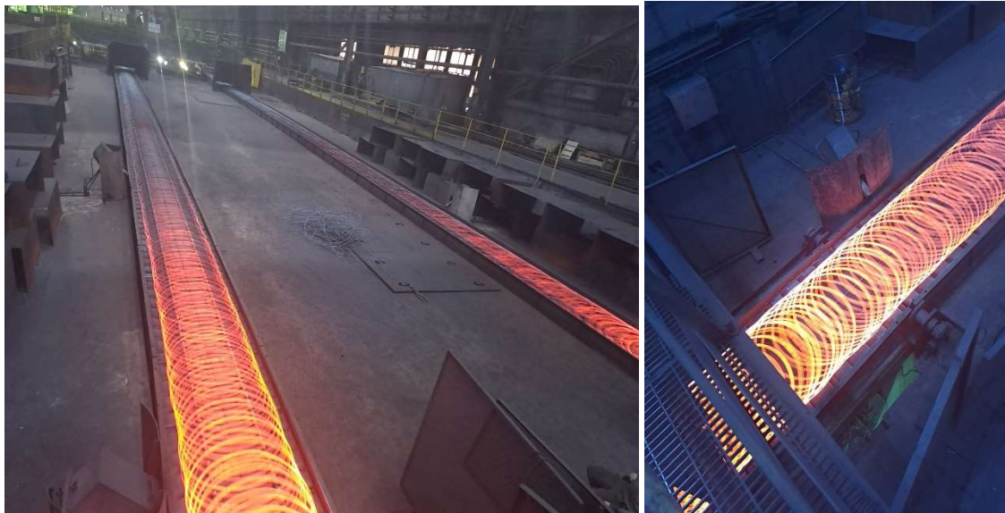
Figure 2. Air Cooling process at STELMOR

ring in the ring" in combination with a sufficient number of high capacity cooling fans, Figure 2.